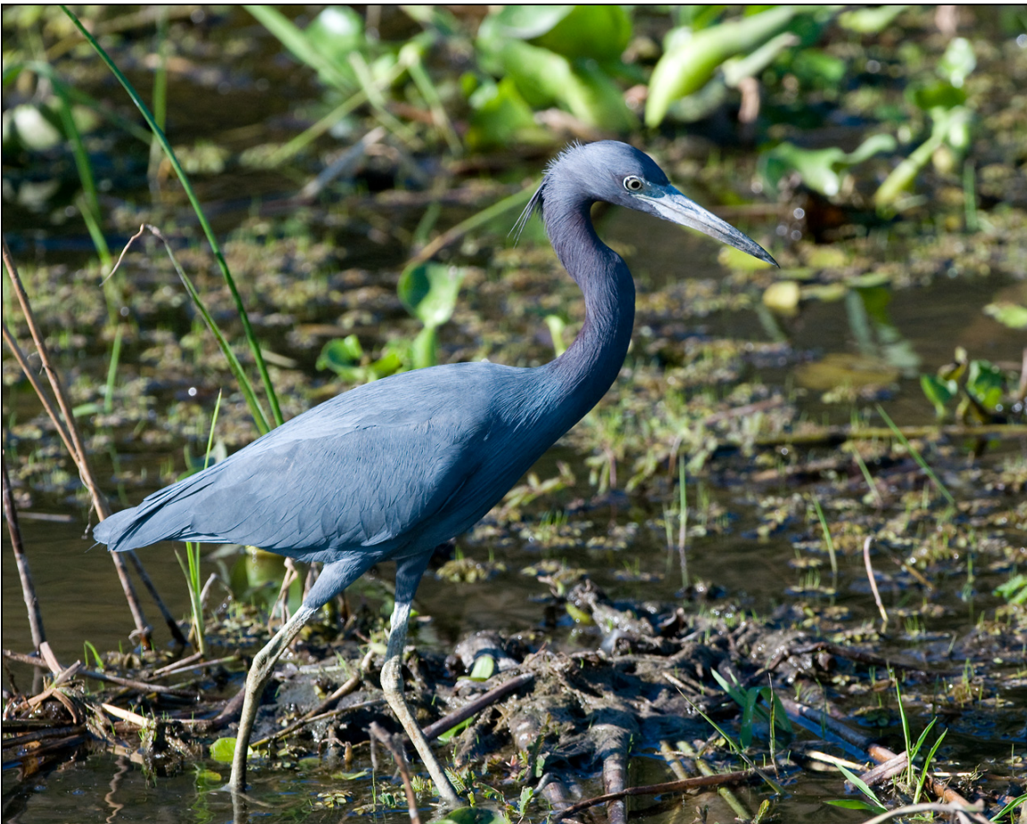
Little Blue Heron