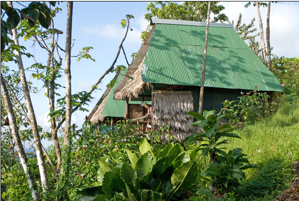
Punta Marenco Lodge

See photo gallery here: http://natur-foto.dk/Rejser.htm