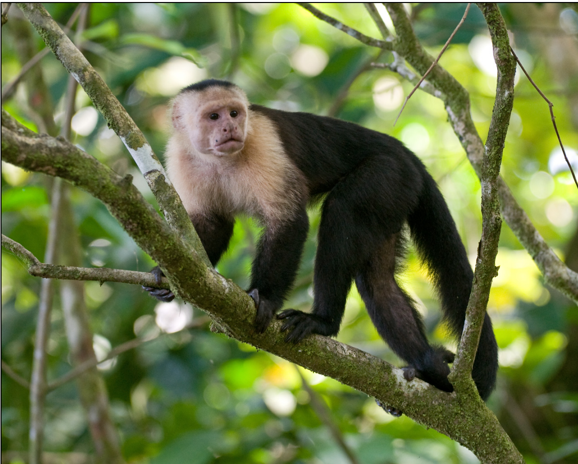
White-throated Capuchin Monkey