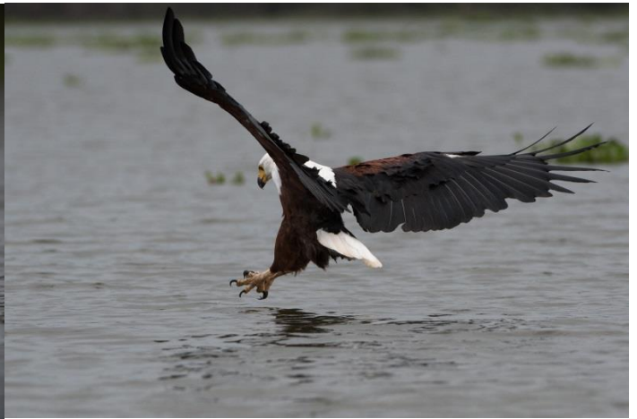
African Fish Eagle

Tuesday Feb 9. Went on to Lake Bogoria Spa Resort with very fine accommodation in small houses on a slope above the main buildings and swimming pools. Spend the afternoon relaxing and birdwatching on the resort which was quite rich in small birds, and also had a big colony of Marabou Stork.