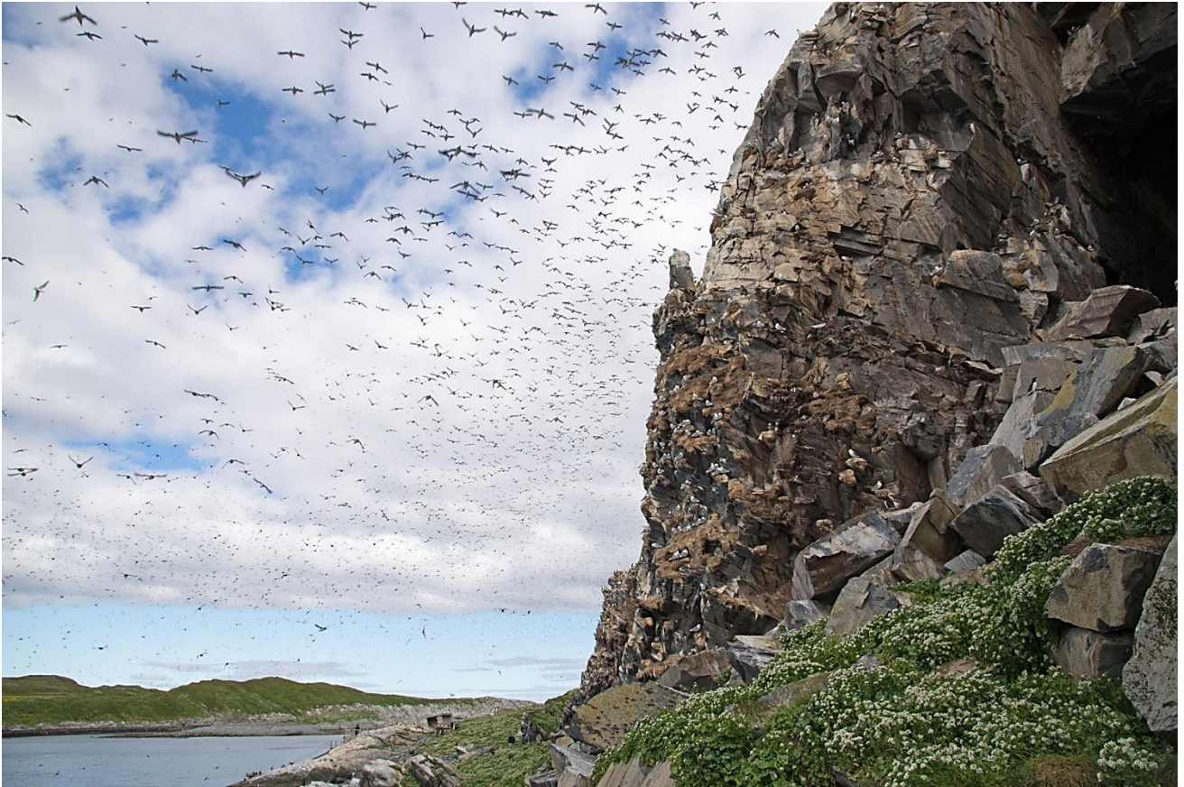
Hornøya with some of the 80,000 pairs of seabirds ( www.hornoya.no )